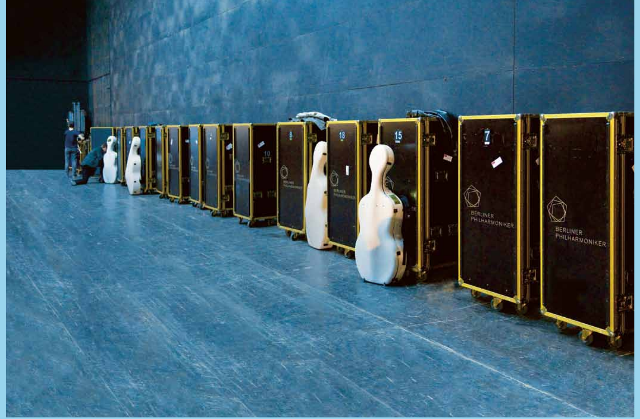
For more than 130 years, the Berliner Philharmoniker has delighted music lovers all around the world.

The Berliner Philharmoniker on tour, in the classroom and in your home.