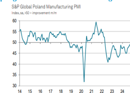
Figure 1. PMI manufacturing

At press conference NBP president Adam Glapinski informed that currently dominating view within the MPC was that a discussion on rate cuts might start in October 2025 not in March 2025 as several MPC members had signalled earlier. NBP President explained that the reason for that was that cap on energy prices would expire in end of September 2025. NBP expects consumer inflation to rise towards 5% in the end of 2025 after decline in Q2 next year. NBP President underlined that discussions on rate cuts wouldn't result in actual rate cut. This comment significantly changed market expectations on size and timing of interest rate cuts next year. The comment of NBP president was alleviated slightly by comment from MPC member Henryk Wnorowski who said that discussion on rate cuts might start after release of NBP inflation projection in March 2025 and added that total size of rate cuts in 2025 would not exceed 100bps. A similar comment came from MPC member Ludwik Kotecki who said that the view of NBP President was not the view of the MPC and added that discussion on rate cuts might still commence in March. MPC Cezary Kochalski said he was slightly more optimistic concerning energy prices in the end of 2025 and added that discussion on rate cuts might start in March 2025 or later. MPC Ireneusz Dabrowski said the central bank might cut interest rates in Q3 2025. MPC Gabriela Maslowska commented that the central bank might start monetary easing in the second half of 2025 or in Q1 2026.