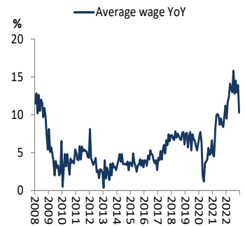
Figure 1. Average wage (y/y growth)

In December industrial output fell by 6.4% m/m and rose by 1.0% y/y. Industrial output in mining and quarrying was 6.9% down y/y, energy production was 13.3% down y/y while growth was reported in manufacturing (up 3.4% y/y) and utilities (up 1.8% y/y). PPI was 0.5% up m/m and rose by 20.4% y/y in December. Construction output was 0.8% down y/y in December.