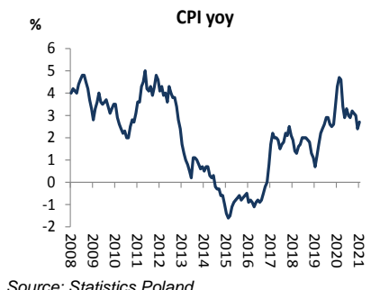
Figure 3. Inflation