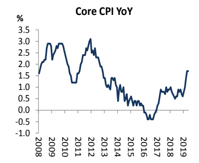
Figure 2: Core inflation