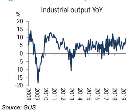
Figure 2: Industrial output