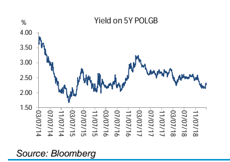
Figure 3: Yield on 5Y POLGB – long term trend