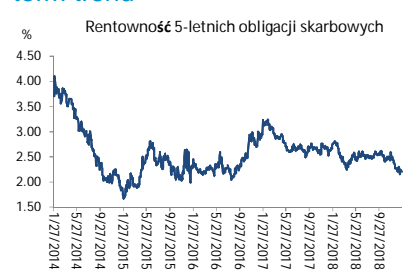
Figure 3: Yield on 5Y POLGB – long term trend

Today economic calendar contains unemployment rate for December from Poland, PMIs from Europe and the US for January and the ECB decision.