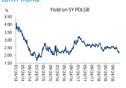
Figure 3: Yield on 5Y POLGB – long term trend